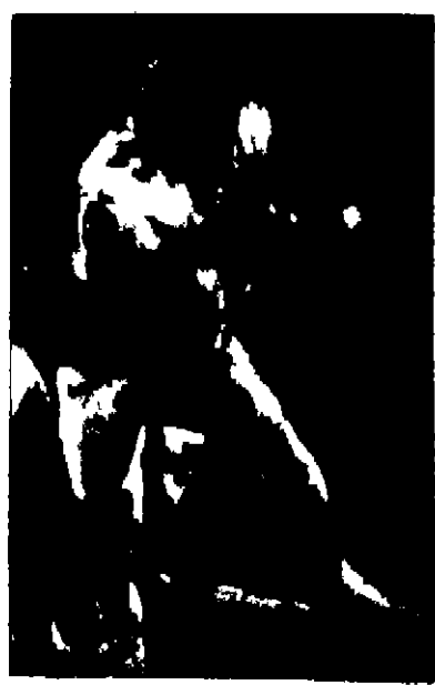
Ravens' running back Priest Holmes finds room to run against the Giants.