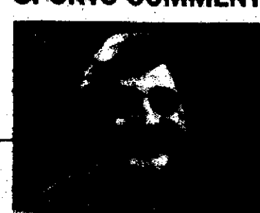
By JOE GROSS